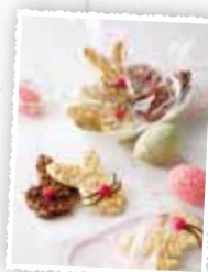
Chocolate Crackle Bunnies 11