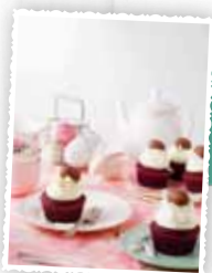
Red Velvet Cupcakes 15