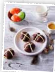
Mini Cream Puffs 5