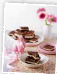
Triple Layer Chocolate Crackle Slice 18