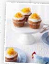
Gluten Free Carrot and Ginger Cupcakes 20