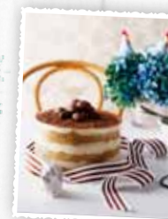
Gluten Free Tiramisu 13