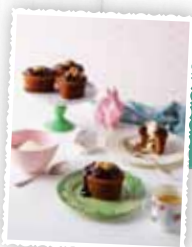
Mini Date, Chocolate and Walnut Cake 10