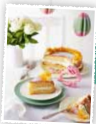
Easter Tea Cake 3