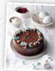
Chocolate Mud Cake 7